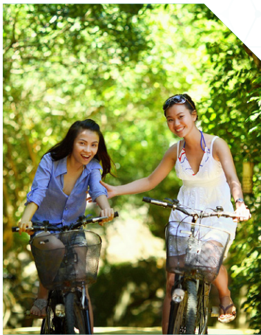
Impact of the HabiTec clinical services on patient outcomes