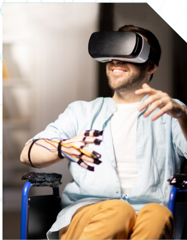
Virtual reality as a novel therapeutic tool in persistent pain management