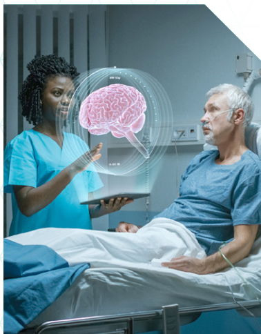
Technology use in specialist rehabilitation services