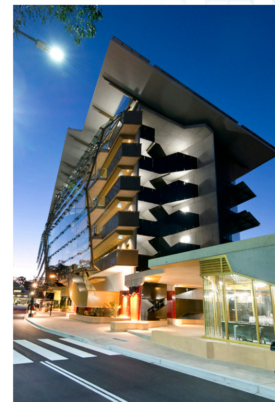
Griffith University Nathan Campus, Queensland